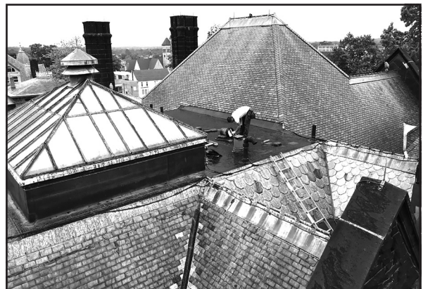
Summer restoration work

Massillon Heritage Foundation recently mailed our 43rd Annual Membership Drive information. All levels of giving are much appreciated! Watch for your Membership information and return today!