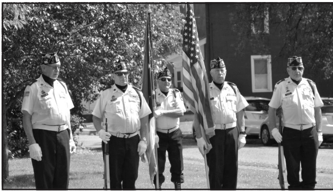
American Legion Color Guard

Massillon citizens were moved from this burying ground shortly after 1848 to the newly established Massillon Cemetery, but it has since been discovered that all graves were not moved. The new monument is intended to be a memorial to all the settlers who were or are buried there. Placing this marker in the historic Kendal Burying Ground is another small step toward preserving the community's past.